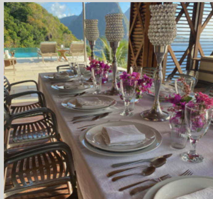
Cosmos White tableware with tall goblet candleholders