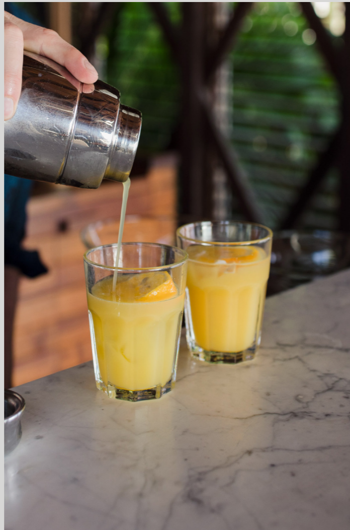
Freshly made cocktails and mocktails

We commission stunning celebration cakes from a top pâtissier in the capital, Castries. The cake maker has mastered a unique marbling technique that renders these cakes works of art. Cakes are finished with rich butter cream or elegant fondant in your choice of colours, and decorated in varying themes, from beach-rustic to more traditional wedding florals. Flavours available include vanilla, chocolate, coconut, red velvet, lemon-basil, vanilla rum and cookies and cream. Choose from two sizes: single tiers 6-8", serves 14; two tiers 6" or 9" (tall) or 7" or 10" (short), serves 20+.