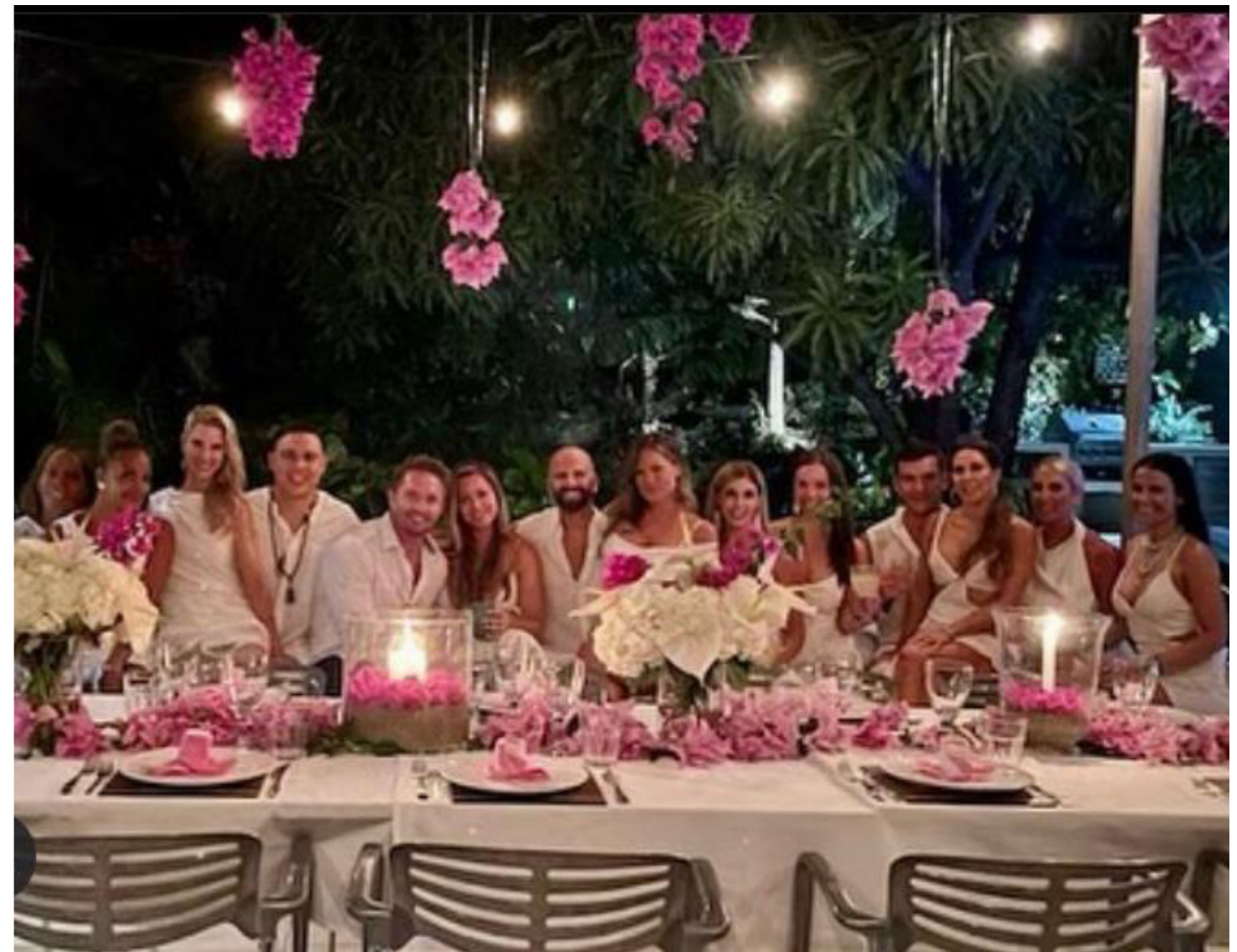
Pretty in pink - a guests 40th with friends at Cosmos