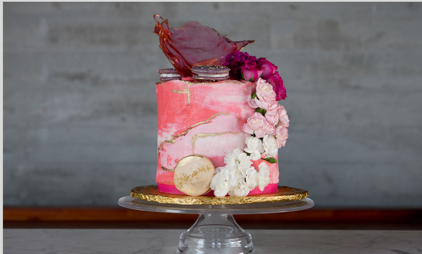
Custom celebration cake by a top pâtissier

We buy flowers directly from farmers in the nearby rainforest and arrange them in our glass vases. In addition, purple and pink bougainvillea blossoms from the Cosmos gardens add a splash of colour on our table settings.