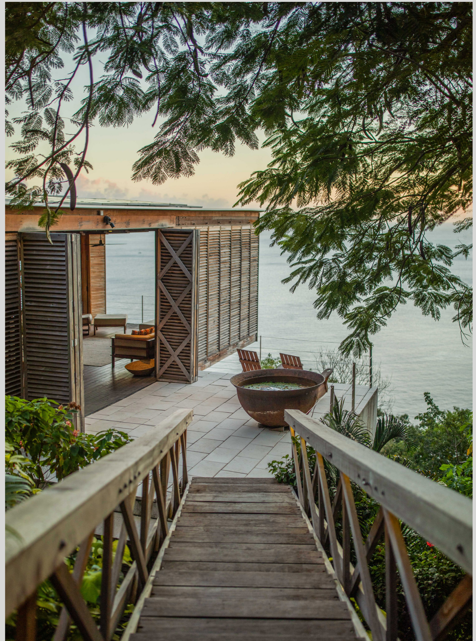
The Sky bridge leads to the Fountain Terrace