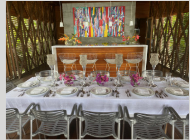
Cosmos White tableware with tall goblet candleholders

Choose from our all white tableware and clear glassware, or our vibrant Colours of the Caribbean collection. Guests are also welcome to bring their own table decorations and cake toppers. Sky lanterns are not allowed given the fire risk they pose for the surrounding woodland, but floating lanterns are permitted.