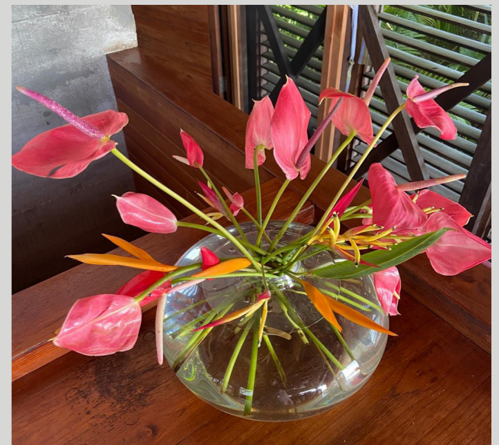
Rainforest anthurium lilies in Cosmos vases