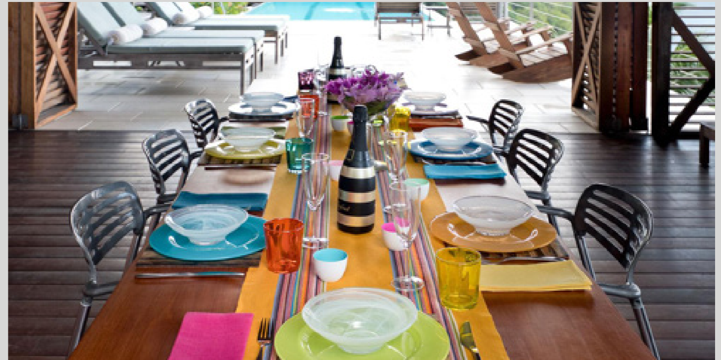
Cosmos Colours of the Caribbean tableware