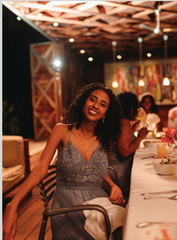
Celebrating at Cosmos

You and your loved ones gathered together, commencing celebrations with Cosmos cocktails and mocktails, made with the island's exceptional tropical fruits. Drinks are served on the Fountain Terrace with its calming water feature and sunset view. Late afternoon is a popular start time, when the heat is cooled by northern trade winds and the light softens, perfect for photos against a variety of backdrops - the Pitons, the Infinity Pool and the terraces. Around six o'clock the setting sun starts to spectacularly paint the sky, bringing an extraordinary ambience to the occasion. A St Lucian musician adds to the occasion, perhaps playing guitar or traditional steel pans.