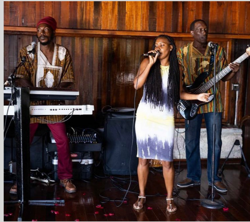
Future Lights - well established five piece band playing fast paced Caribbean Soca, a fusion of African/Calypso and East Indian rhythms.